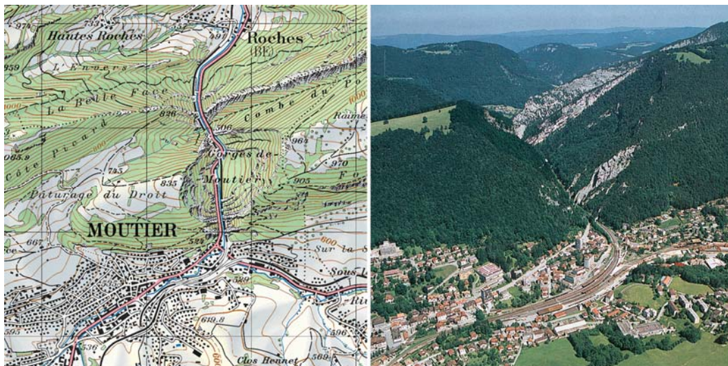
Figure 2: Klus of Moutier in the Jura Mountains (Switzerland). Left: section of a topographic map 1:50 000 (SwissMap 50: © Swisstopo, Wabern; SWISSTOPO 2003); right: aerial perspective view (SCHWEIZER WELTATLAS 2004).

What kind of 3D maps and what functionality should be offered effectively within the planned atlas? The concept and possible interactions will be discussed and shown by the first 3D map example. The example reveals the geological structure of a transversal gorge valley in the Jura mountains next to the village of Moutier in Switzerland (figure 2). Because of the characteristic hilly shaped terrain, the different anthropogenic infrastructure and vegetation patterns, the so-called "Klus" is an ideal example to teach the impact of natural geomorphologic processes on human-made structures. The content of the 3D map shows the didactic concept. Different thematic layers like geology, vegetation or traffic networks can be superimposed on a section of the digital terrain model DHM25 (SWISSTOPO 2005/3).