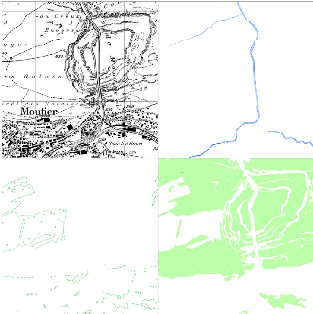
Figure 3: Colour separated layers of the Pixel map PM25, the digital Swiss national topographic map 1:25 000, depicting the region of Moutier. Left above: situation (with buildings, traffic network, cartographic information, labelling); right above: river network; left bottom: forest boundaries and single trees; right bottom: forest areas (PM25: © Swisstopo, Wabern; SWISSTOPO 2005/1).

(with ADOBE Illustrator ). Then, the intended thematic layer combinations will be exported as raster images with a reasonable resolution. Alternatively, raster-based thematic data will be directly imported as layers into a raster file (e.g. in ADOBE Photoshop ) in order to create composites. Finally, the prepared raster or vector- data will be converted to thematic. There may possibly result many different combinations.